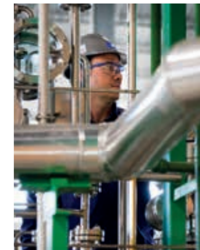
Development of new methodologies